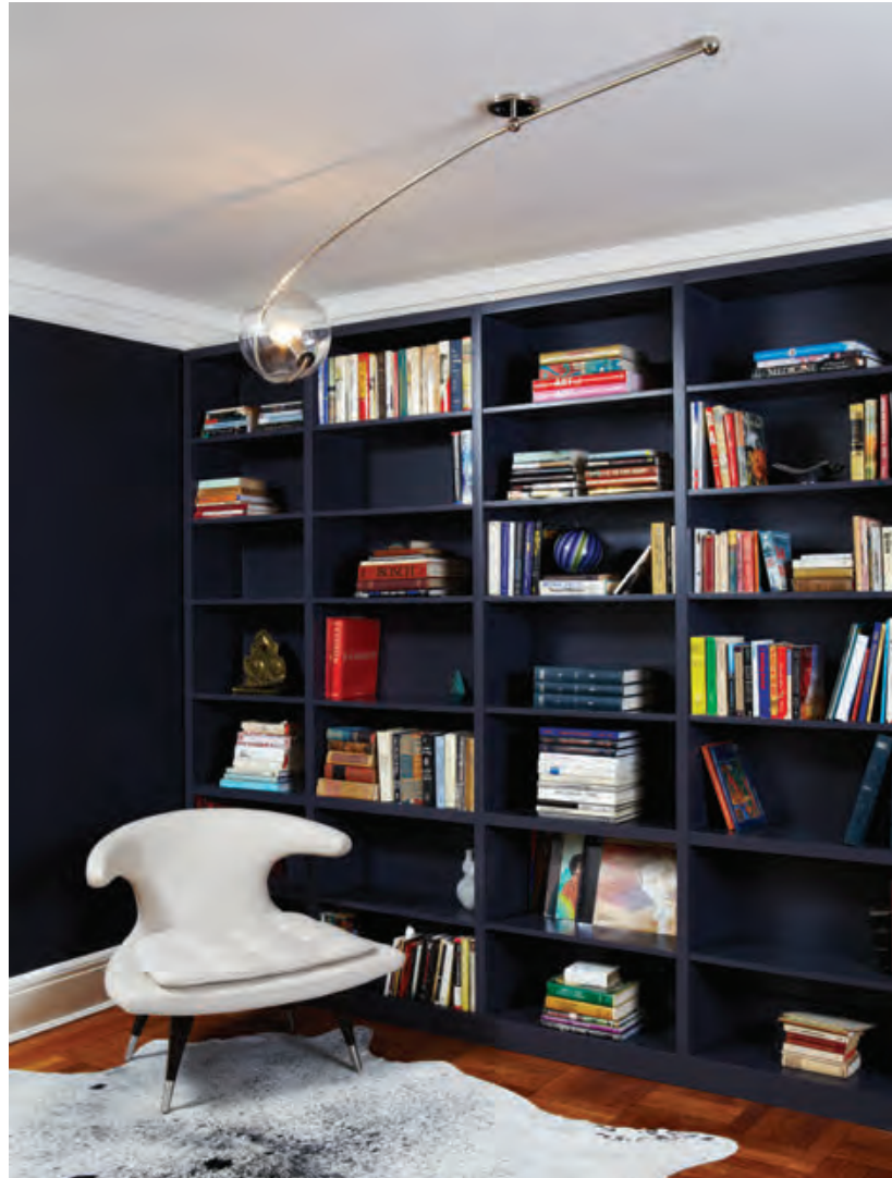
Cantilever (Polished Nickel / Clear) L 106 in / 269 cm × W 10 in / 25 cm × H 31 in / 78 cm