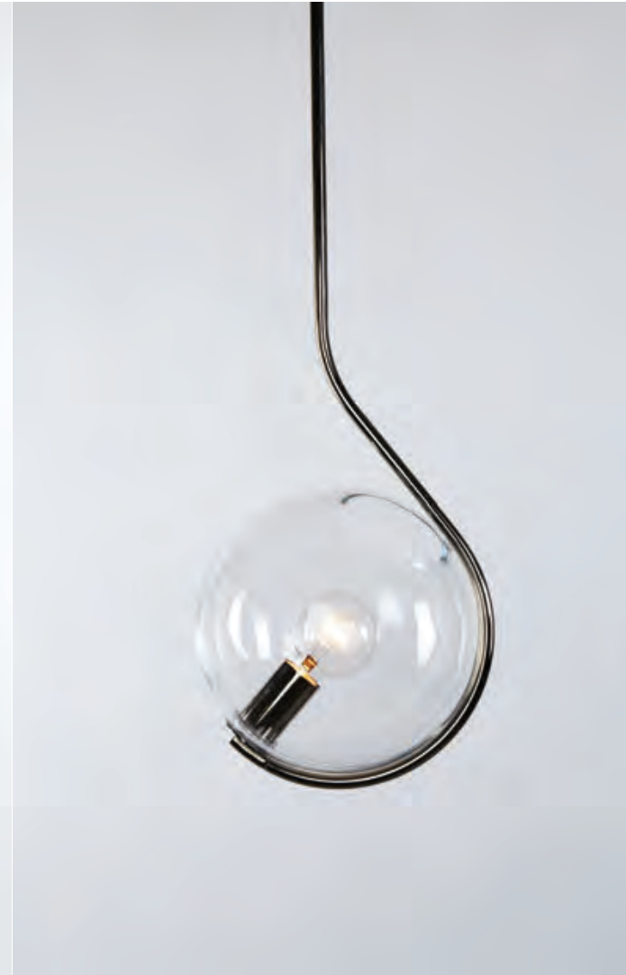
Pendant (Polished Nickel / Clear)

L 10.5 in / 27 cm × W 10 in / 26 cm × H 16 in / 41 cm