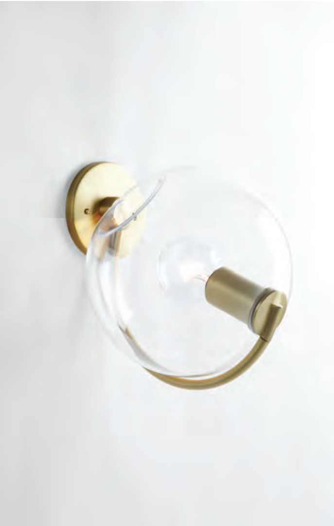
Sconce (Brass / Clear)

H 10.5 in / 27 cm × W 10 in / 25 cm × D 11 in / 28 cm