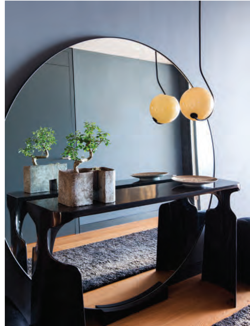
Pendant (Blackened Steel / Cream) L 10.5 in / 27 cm × W 10 in / 26 cm × H 16 in / 41 cm