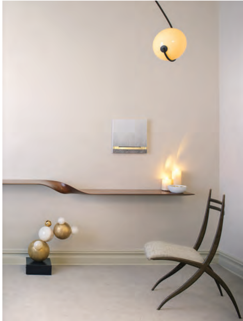
Cantilever (Blackened Steel / Cream) L 106 in / 269 cm × W 10 in / 25 cm × H 31 in / 78 cm