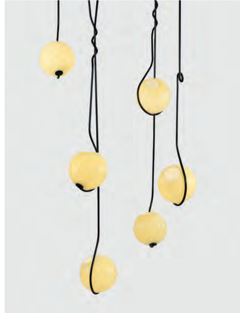
Custom Configuration (Blackened Steel / Cream)